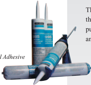
Silicone Structural Adhesive

The flexibility of this system will also increase the ability of the system to cycle due to blast pulse and wind storm energies that create positive and negative pressure effects or by twisting forces associated with earthquakes. In addition, resistance to smash-and-grab and forced-entry impacts can also be improved with the installation of Ultraflex.