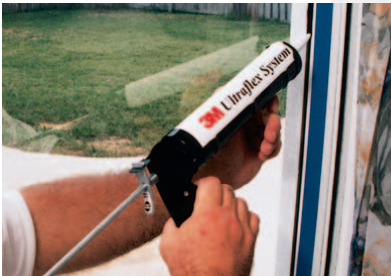
3M™ Ultraflex Window System

3M Ultraflex Window System allows the frame to bend and twist to accommodate a variety of stresses, increasing personal safety from flying glass. For ease of use, the Ultraflex System offers a simple, more cost effective attachment system when compared to more bulky mechanical attachment alternatives. The Ultraflex System will replace the window gasket and blend with the frame system to look as good as the gasket it replaces.